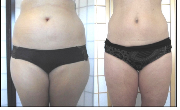
5 Treatments In 4 Weeks