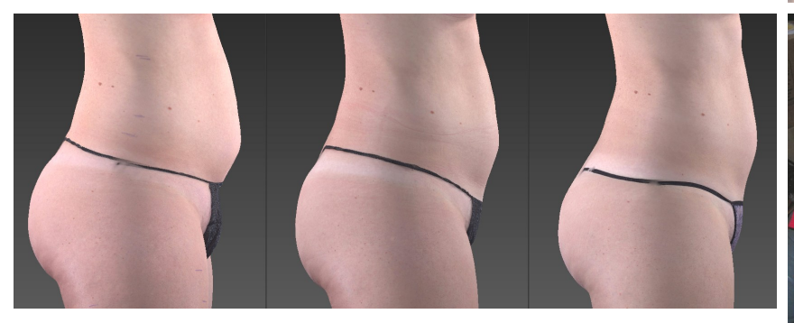
3 Treatments In 2 Weeks

Whether you want to fine-tune your body contours, jumpstart lifestyle changes, or desire the more dramatic results of a whole body transformation, UltraSlim can help you achieve your goals. and enjoy a happier, healthier lifestyle.